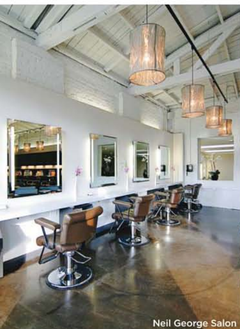
Neil George Salon

From Summer Hair to Sensitive Scalp, Frédéric Fekkai's exhaustive haircare collections are a stylist's staple. fredericfekai.com .