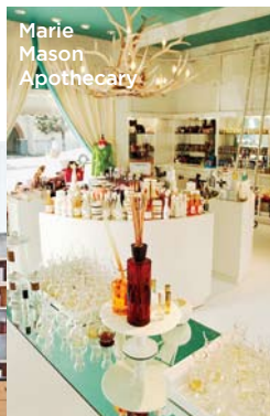
Marie Mason Apothecary

Vert 1121 Abbot Kinney Blvd., Venice, 310-581-6126; vertlosangeles.com .