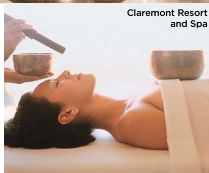
Claremont Resort and Spa